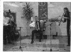
Das polnische Trio „Die Galtzymer Klezmer“ macht das Abschlusskonzert der Reihe „Musik in alten Dorfkirchen“ in Nordhofen zu einem mitreißenden Erlebnis.